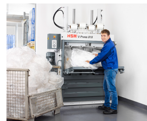
Low installation height and small footprint