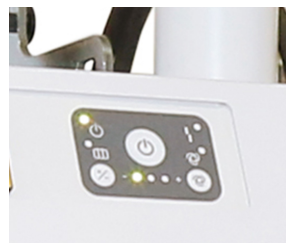
Microprocessor controller with membrane keypad