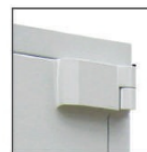
Heavy Duty Chassis