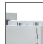
Solid Chromed boltwork