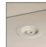
Mounting Hole (Optional)