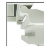
Vertical Interlocking Rebate System