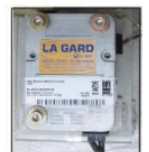
Glass Relocker (Optional)