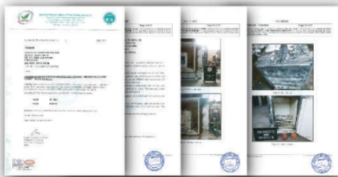
Tested & Certified to JIS S 1037 : 1989 FIRE RESISTIVE CONTAINERS